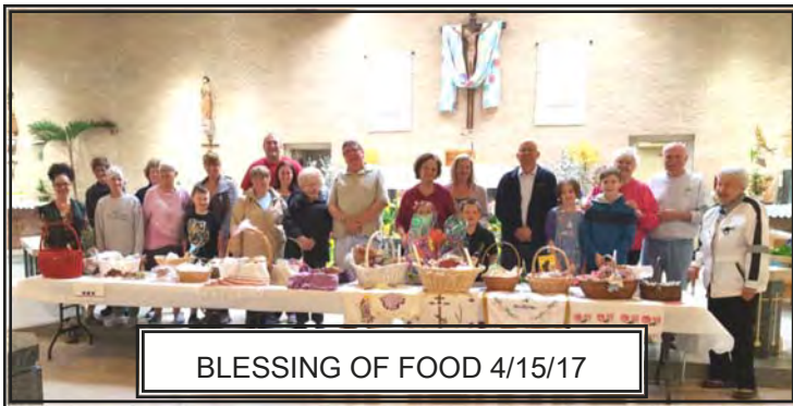
BLESSING OF FOOD 4/15/17