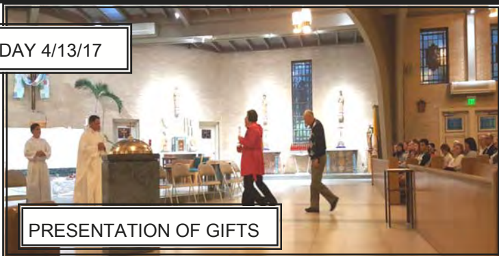
PRESENTATION OF GIFTS