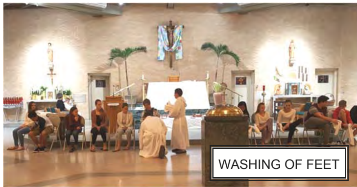
WASHING OF FEET